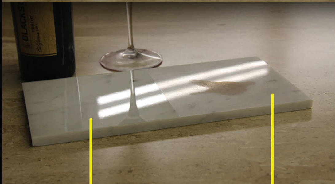
Protected with StoneGuard® Clear